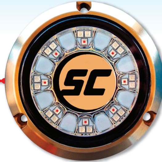
SCR Underwater Light