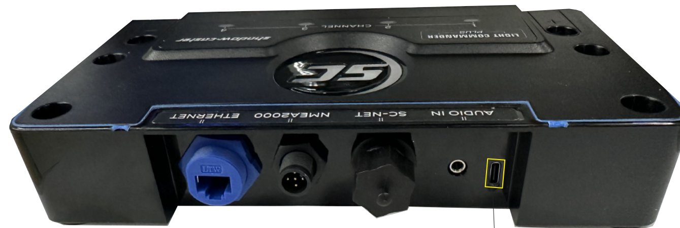
LIGHT COMMANDER PLUS REAR PORTS PANEL