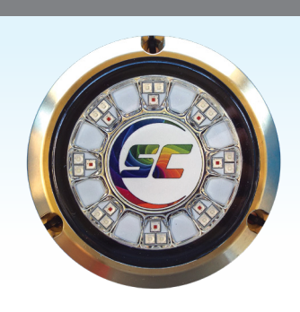
SCR-24-CC Full Color Underwater LED Lights