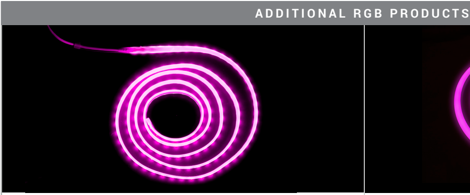
SCM-AL-LED-08 | SCM-AL-LED-16 Accent Lighting LED Strip Available in 8' or 16'