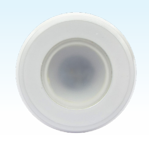
SCM-DL-CC Full Color Overhead Lighting (available in white or black)