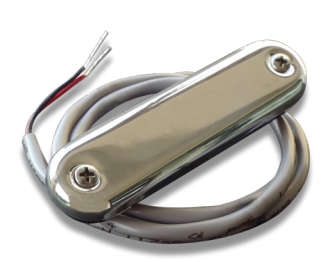
SCM-CL-RGB-SS Full Color Courtesy Lights